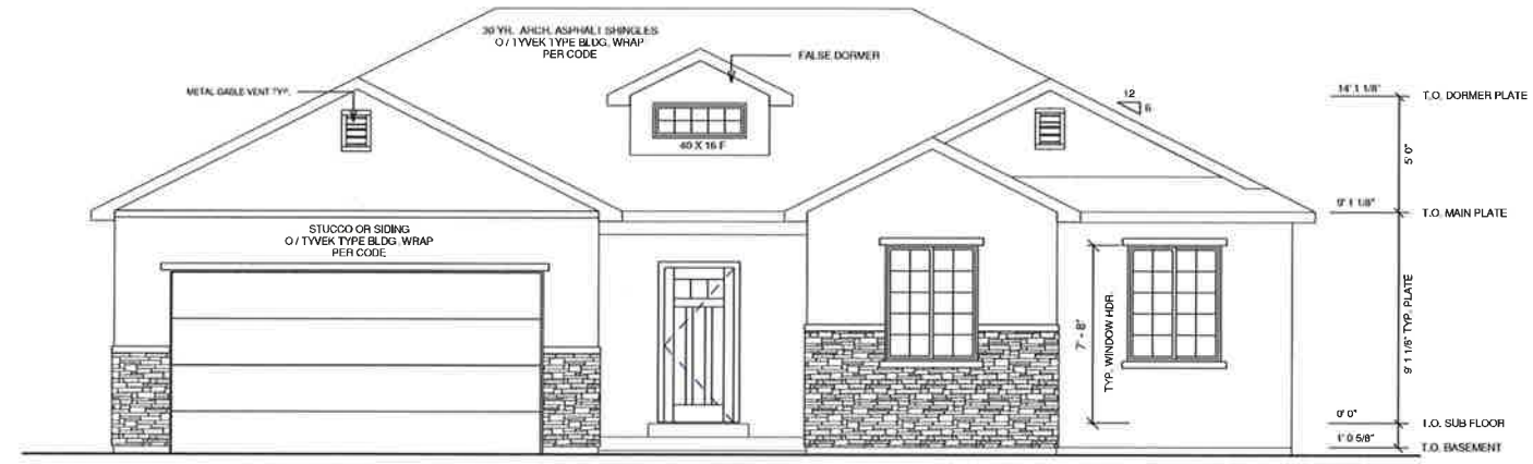
① FRONT 1/4" = 1'-0"